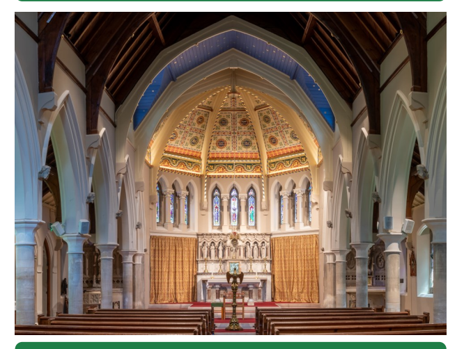
Our Lady of Peace