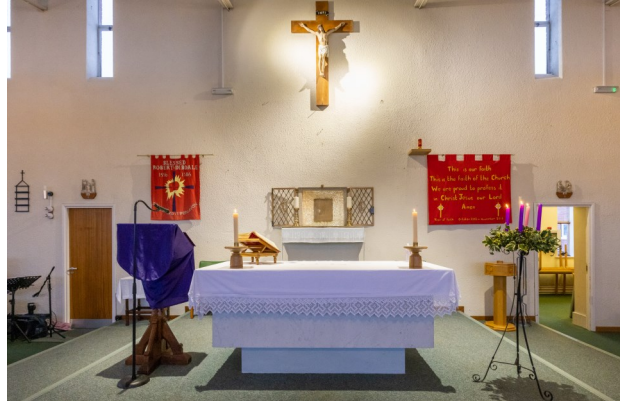
At the time of printing this leaflet there are plans to renovate and develop Our Lady of Peace. See our website for more information.